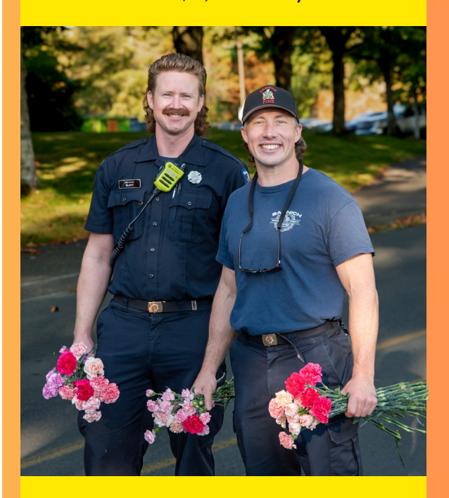
If your team raises over $10,000, the Canadian Cancer Society may be able to send a staff or volunteer representative to your workplace for a cheque presentation!